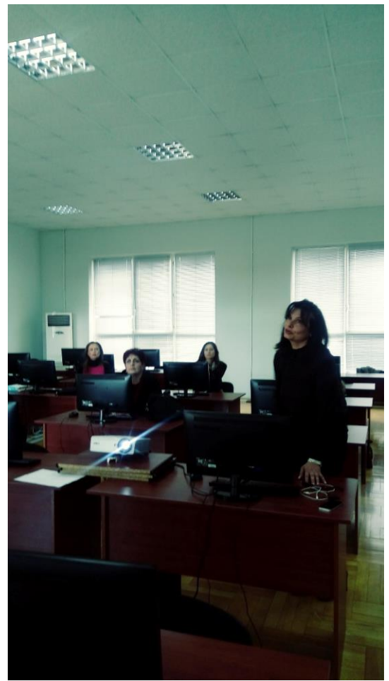
Programs presentation: “Panopto” and “Movie maker” (#6,7,8)