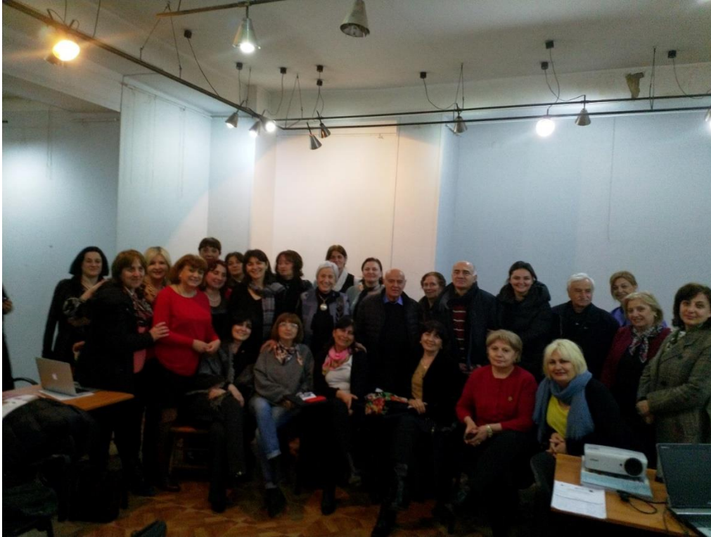
The end of training

After successful completion of the course the participants were awarded appropriate certificates.